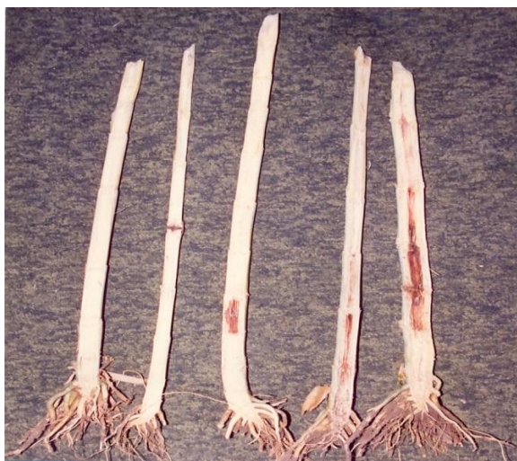
Figure 1: Different degrees of Fusarium stalk rot (1-5) in Giza 15 sorghum plants

*S = Highly susceptible, MS = Moderately susceptible, R = Resistant